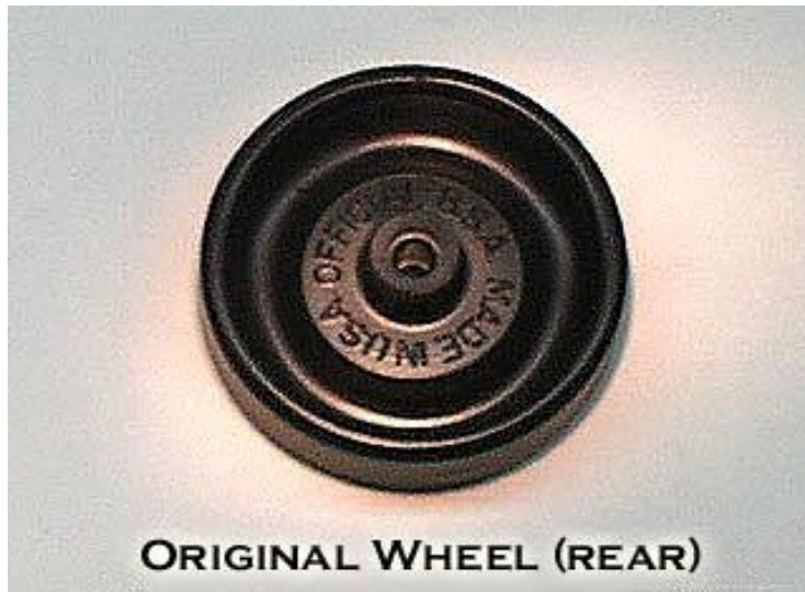
ORIGINAL WHEEL (REAR)