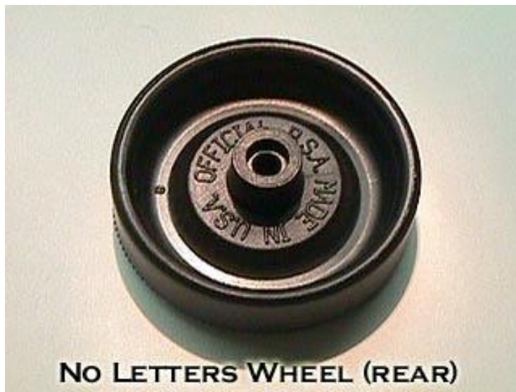
NO LETTERS WHEEL (REAR)