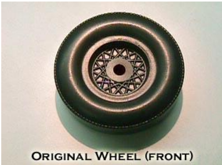
ORIGINAL WHEEL (FRONT)