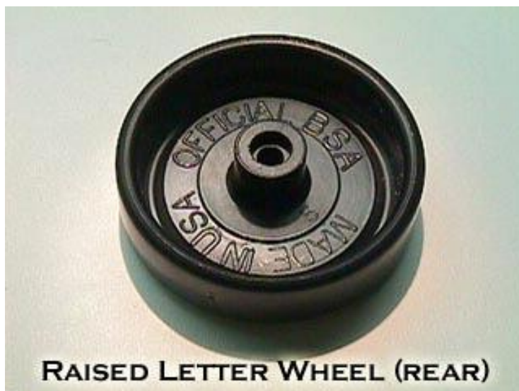
RAISED LETTER WHEEL (REAR)