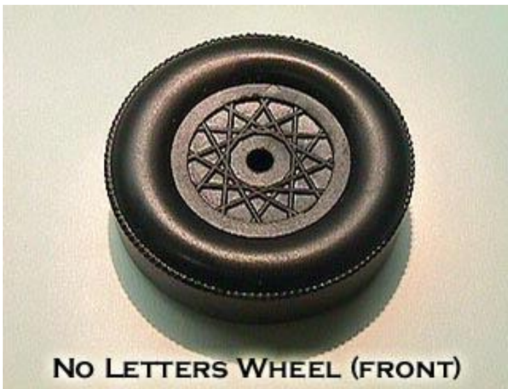
NO LETTERS WHEEL (FRONT)