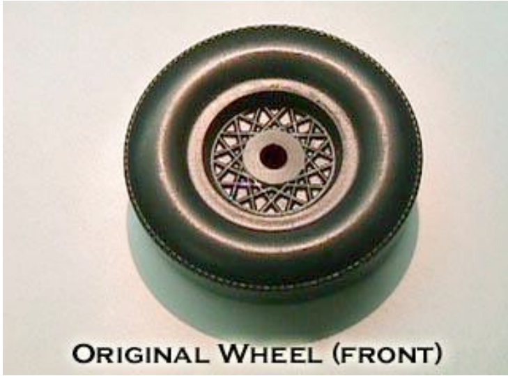
ORIGINAL WHEEL (FRONT)