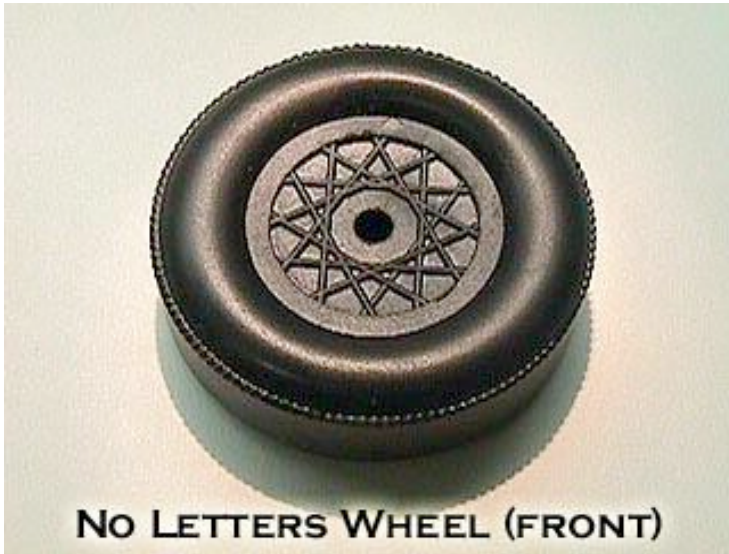
NO LETTERS WHEEL (FRONT)