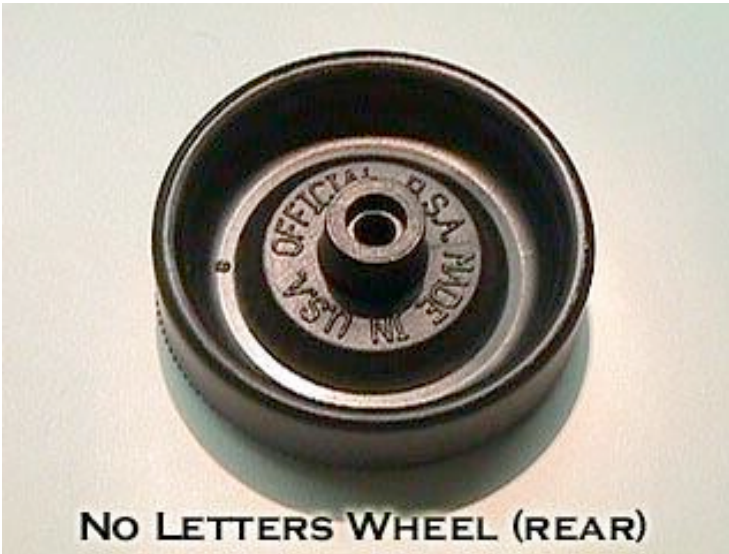
NO LETTERS WHEEL (REAR)