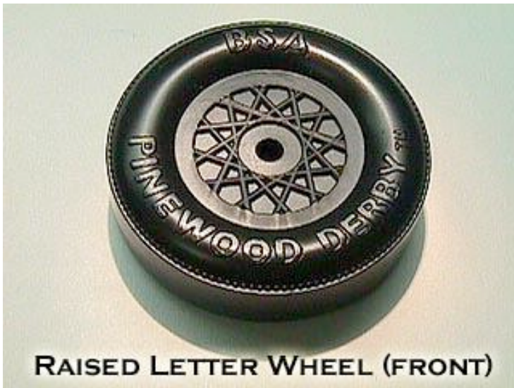
RAISED LETTER WHEEL (FRONT)